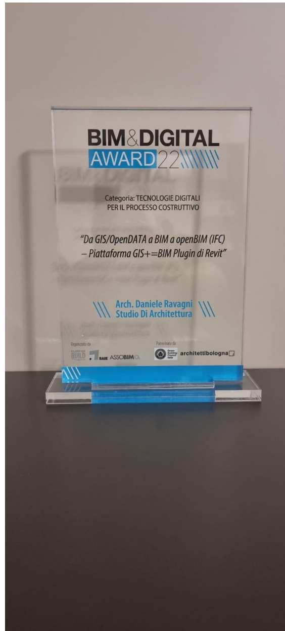
2022 - BIM&Digital Award