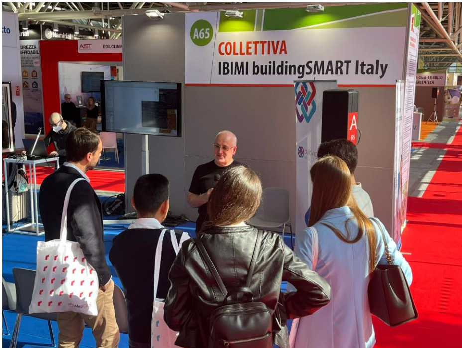
2022 – Presentazione del Plugin di Revit al SAIE Bologna stand IBIMI bSMART